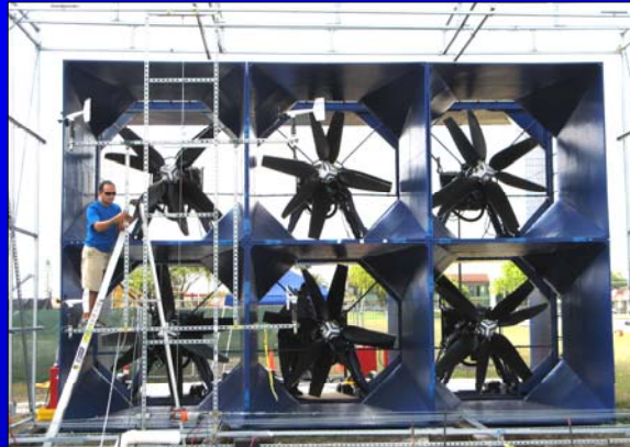
6-Fan RenaissanceRe Wall of Wind to Test Single-Story Structures with Category 4 Hurricane Wind-Rain Simulation. Supported by RenaissanceRe Holdings Ltd. and the State of Florida.