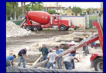
RenRe WOW Facility at FIU (September 2007)