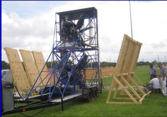
2-Fan Mobile Wall of Wind to Test Structures with Category 3 Hurricane Wind-Rain Simulation. Supported by State of Florida Division of Emergency Management