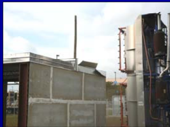
Roof Fascia Testing for Advanced Roofing