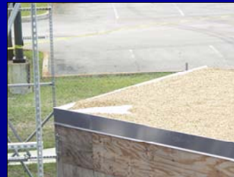
Vortex Suppression Technology Testing