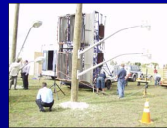
Florida Power and Light (FPL) Equipment Testing