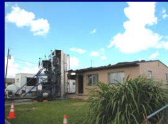
Testing of Real House in Sweetwater City of Miami